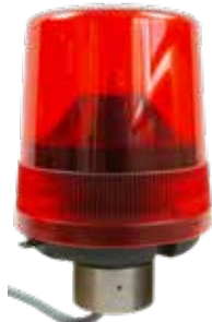
1.5" flange bracket